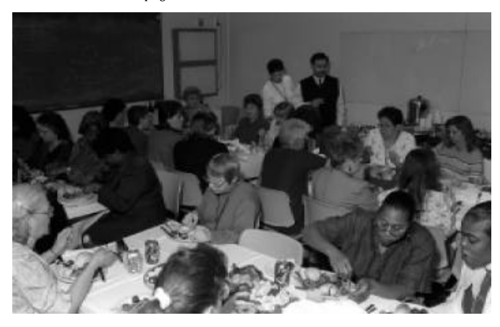
Special Luncheon for Clerical Support Staff

The luncheon was a very pleasant event with a delicious menu, which was provided by Banquet Services. The support staff had a wonderful time and their appreciation for such a nice interlude was evident. Thanks to all for helping to make it a wonderful event. §