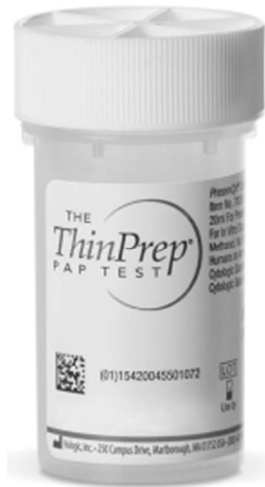
Plastic over wrap is completely removed.