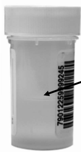
Barcode label: vertical, smooth, aligned with PreservCyt® Solution label

Please avoid placing labels over this blank window on the vial