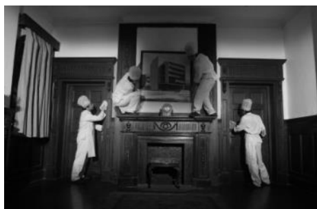
Yang Fudong, Seven Intellectuals in Bamboo Forest, Part V 2007, C-print, 120 x 180 cm, ed 5/10

To kick off fundraising for this worthy cause, Art Creates Cures will present the premier annual Art Creates Cures Charity Gala and Auction on Wednesday, 28 March, 2018 to launch the foundation. The inaugural event of the newly established non-profit foundation will take place at the elegant Four Seasons Hotel in Hong Kong. Bringing together leaders in the art and science communities, the foundation aims to accelerate and transform cancer research by uniting the creativity and ingenuity of artists and that of biomedical scientists. The gala will allow guests to support pancreatic cancer research through their financial contributions as well as give them the opportunity to bid on unique experiences. Contemporary artworks donated by collectors and such world-renowned artists as Zhang Huan, Hu Junjun, Xu Bing, Zhao Bandi, Yang Fudong, among others, will be sold as part of the Sotheby's 2018 Spring Sale with the proceeds also supporting Johns Hopkins' fight against pancreatic cancer.